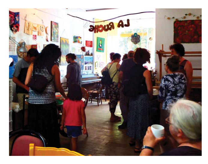
Figure 5. Traveling art exhibit.

draw something into the here-and-now, in order to see, describe, and name what we can hold from our shared community experience together (Figure 5).