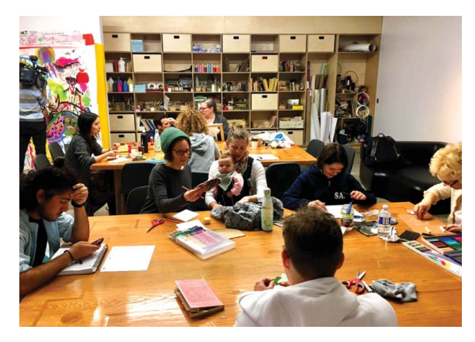
Figure 3. Montreal Museum of Fine Arts Art Hive.