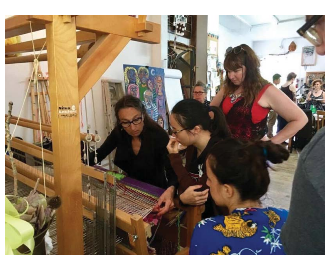
Figure 2. Storefront classroom.